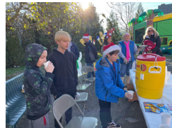
Three Wise Guys?

This week our youth joined our missions committee for a bit of fun and service at the Christmas Open House in downtown Corbin. They had fun getting their faces painted, riding the train, and serving our community by handing out delicious hot chocolate on a sunny, but chilly Sunday afternoon!