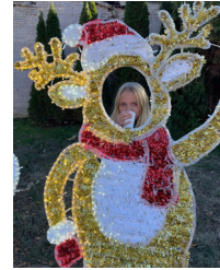
Kirsten the Reindeer?