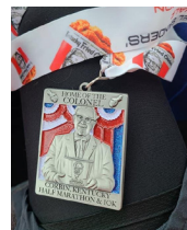
Another one in the books

They do not look any worse for the wear.