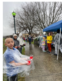
On the ready!!!