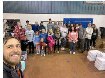
The Whole Crew