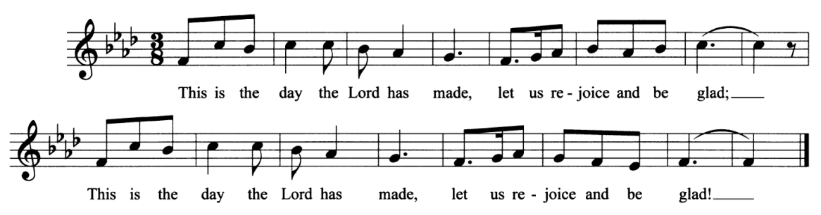
Give thanks to the Lord, for God is good; God's mercy endures forever; Let the house of Israel say: "God's mercy endures forever." REFRAIN The hand of the Lord has struck with power, God's right hand is exalted, I shall not die, but live anew, declaring the works of the Lord. REFRAIN The stone which the builders rejected has become the cornerstone, The Lord of love and mercy has brought wonder to our eyes! REFRAIN