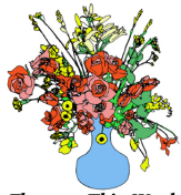
Flowers This Week