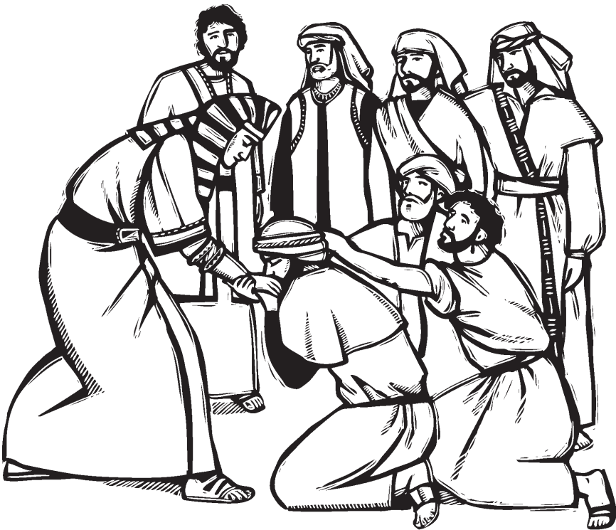
Joseph Forgives His Brothers

401 NORTH LAUREL AVENUE | CORBIN, KENTUCKY 40701 | (606) 528-4738