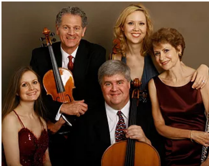
The American Chamber Players Saturday, April 29, 2017 First Baptist Church, Corbin, KY 7:30 p.m.

The Fine Arts Association of Southeastern Kentucky presents: