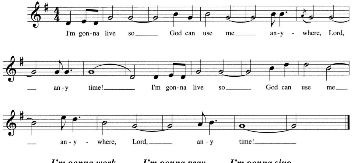
I'm gonna work .... I'm gonna pray .... I'm gonna sing .... - African-American spiritual